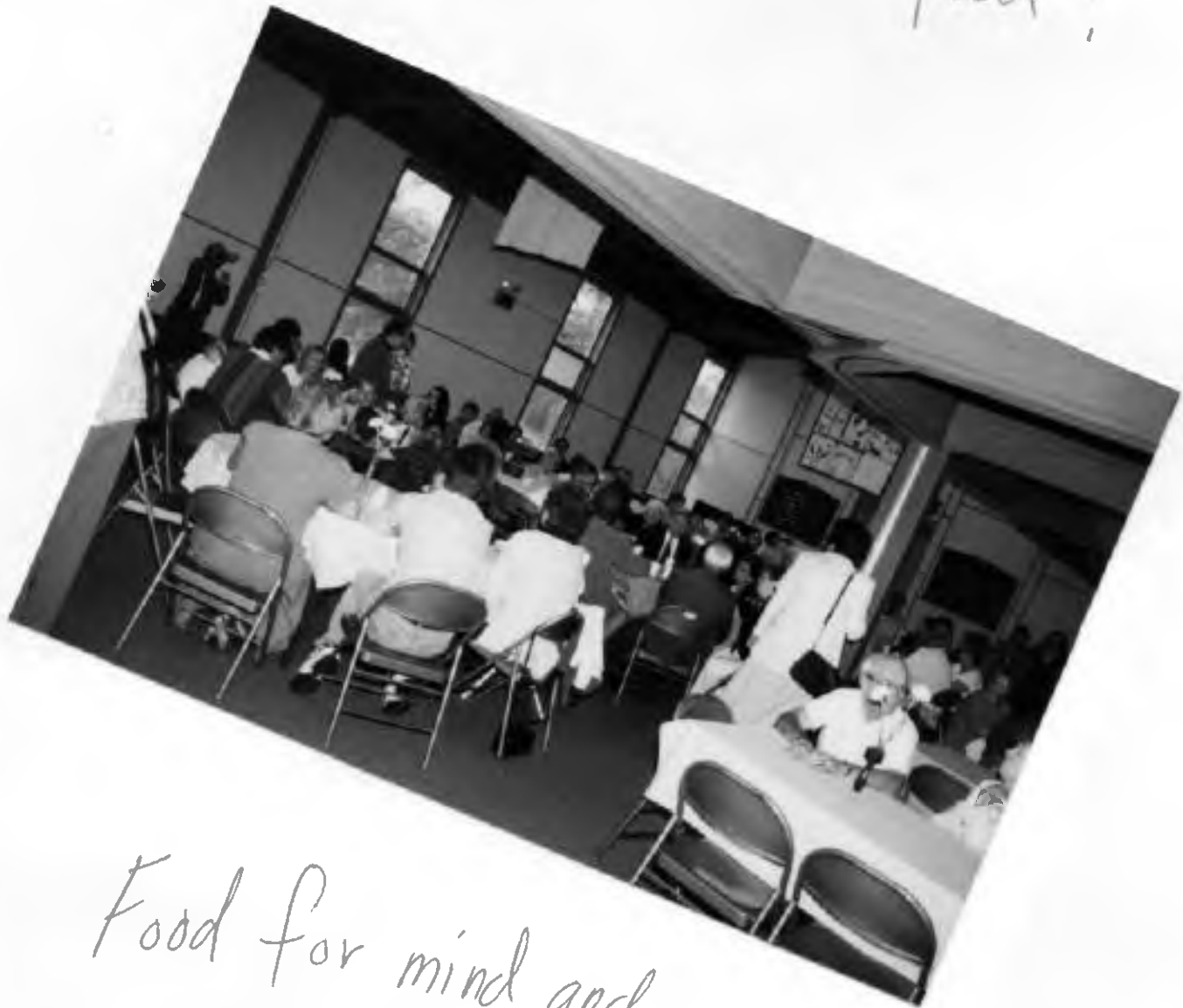
Food for mind and soul.