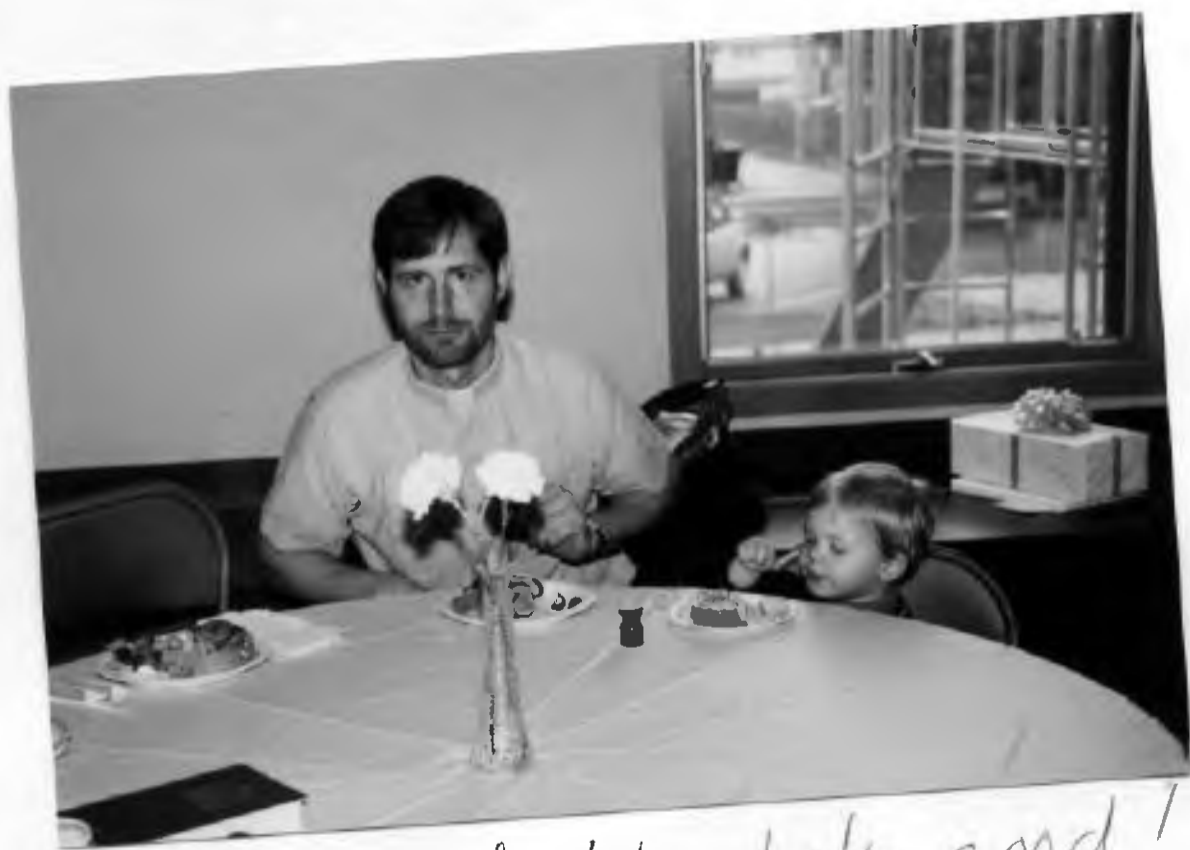
"Boy, Dad this looks good!"