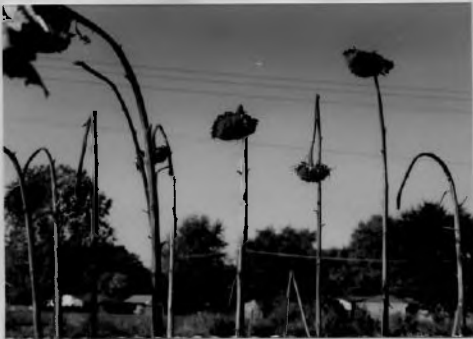
Alas, no one gets into dead flowers but me and the birds,