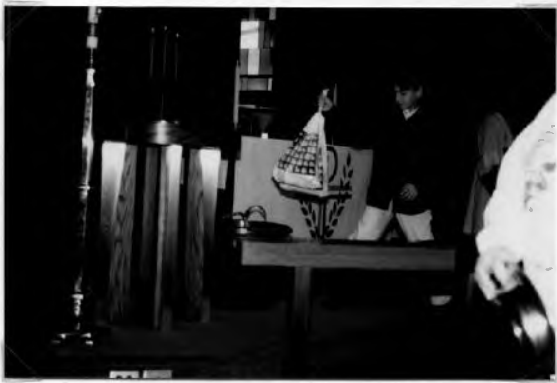
"P.A.D.S." Project" 1996