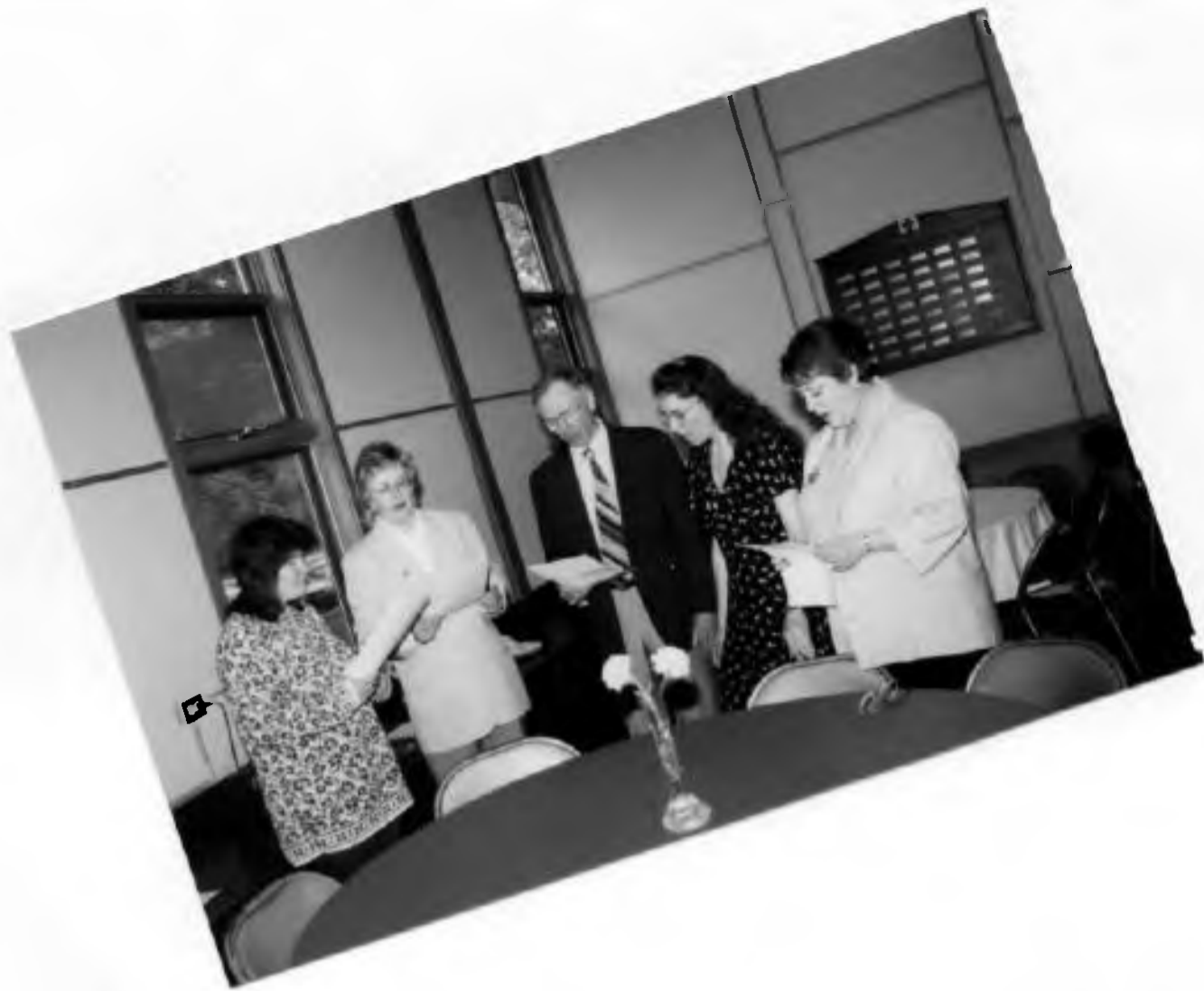
"Our bye-bye brunch!"