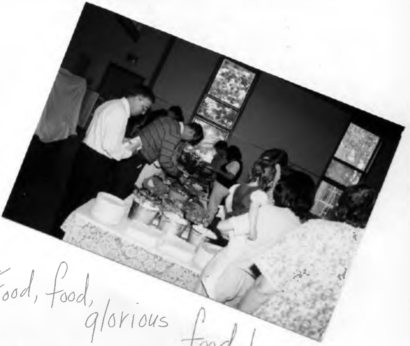
Food, food, glorious food!