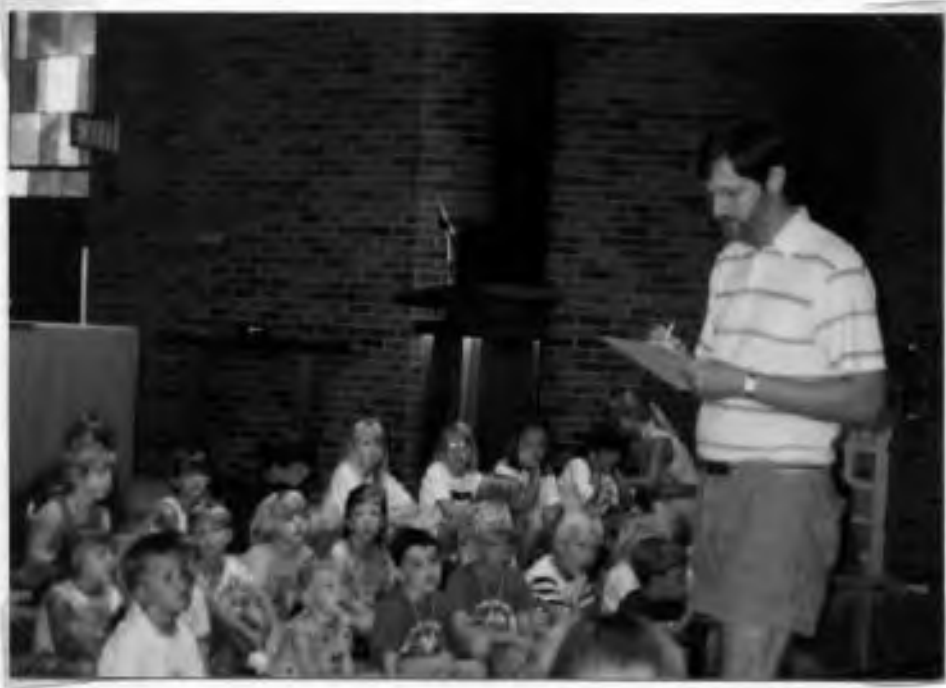
"Creation" Camp" 1995